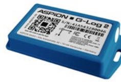
ASPION ■ G-Log 2