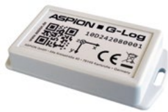
ASPION ■ G-Log*